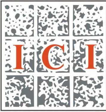
INDIAN CONCRETE INSTITUTE HYDERABAD CHAPTER